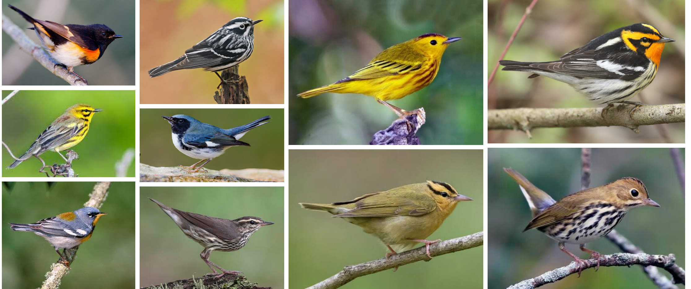
American redstart, Black-and-white warbler, Yellow warbler, Blackburnian warbler, Ovenbird, Worm-eating warbler, Northern waterthrush, Black-throated blue warbler, Northern parula, Prairie warbler, and others