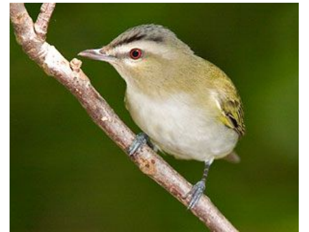
Painted bunting, Tufted titmouse, Blue grosbeak, Red-eyed vireo, white-eyed vireo, Eastern phoebe, Indigo bunting, Blue-gray gnatcatcher, among others